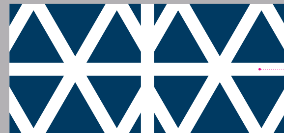
BUSINESS CARD EDGE